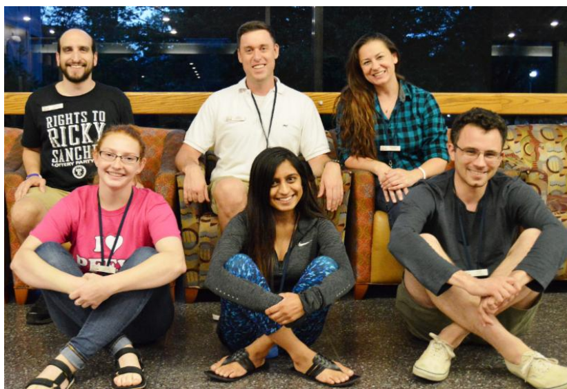
Pictured above are six Company Advisors who serve together at