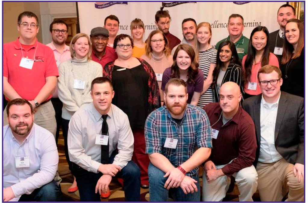
Pictured here are the PFEW Alumni from all decades in attendance at the 40th Anniversary celebration. These wonderful men and women have come back to PFEW to serve as Interns, RAs, Speakers, and Company Advisors. We're so grateful that they have made PFEW a very special part of their lives!

On November 17, over 100 friends of PFEW gathered at the Holiday Inn in Williamsport, PA to celebrate forty years of PFEW magic. Alumni, volunteers, staff, and supporters enjoyed a wonderful evening of friendship, laughter, tears, and joy as they caught up with old friends, made some new friends, and sampled a sumptuous bounty of famous regional foods donated by Pennsylvania companies. All in attendance tried their luck on lively Chinese and live auctions, and enjoyed wonderful giveaways donated by many companies across our great state. But the clear highlights of this amazing evening were the stories of four decades of the PFEW experience as told by our wonderful PFEW alumni from each decade. The evening concluded with more reminiscing and dancing. It was the perfect night to celebrate all things PFEW -- past, present, and future. Here's to another forty phenomenal years!