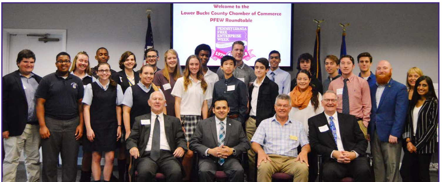
This past September, the Lower Bucks County Chamber of Commerce hosted yet another wonderful breakfast roundtable to celebrate PFEW. Pictured here are 2018 PFEW graduates from Lower Bucks County, Lower Bucks County Chamber board members, and local PFEW Company Advisors.